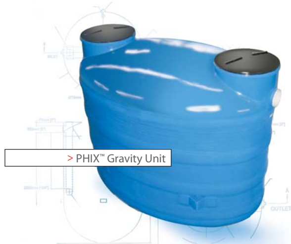
> PHIX™ Gravity Unit

Engineered for commercial, institutional and industrial gravity flow applications, the versatile PHIX™ Gravity Series both removes solids and neutralizes wastewater. The PHIX™ Gravity Series is constructed from durable fiberglass or polyethylene and uses consumable, non-toxic media for reliable and consistent wastewater neutralization.